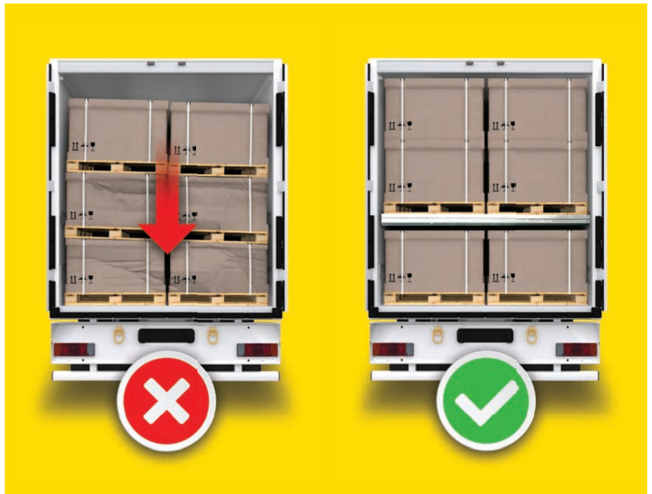
Without the Kaptive Beam® system