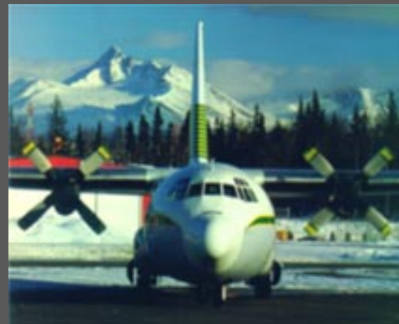
Intra-company capability to rural locations.