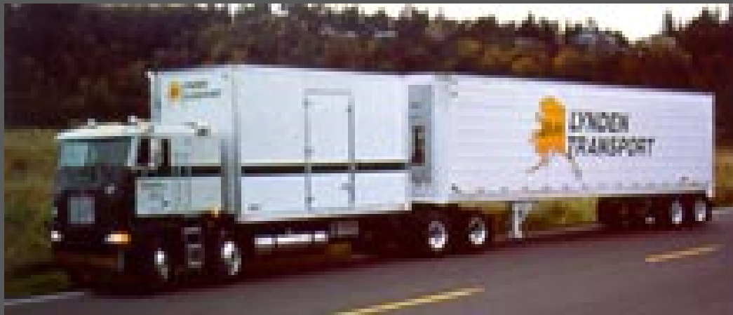
Most diverse and specialized fleet of equipment in Alaska.

Our investments continue to provide customers with better service through newer and more specialized equipment, efficient terminals and sophisticated communications services. Serving you to the best of our abilities has always served Lynden to the best of our expectations.