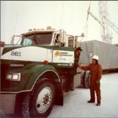
Complete heavy haul capability.