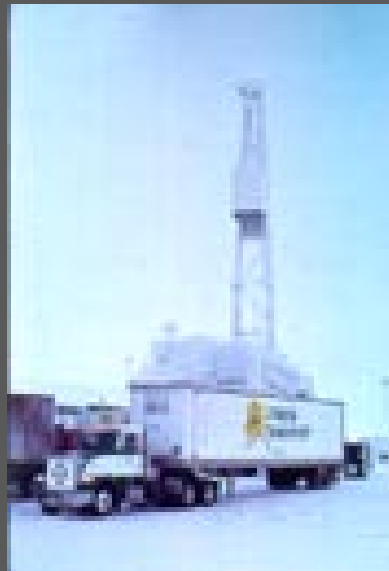
Complete oilfield capabilities.

Lynden's quality is apparent to the discriminating observer. Lynden's initial challenge was to provide a quality service in the harshest of physical environments. We're taking this pioneering attitude of service to a new level of excellence through a quality program fulfilled by our most important resource... our people.