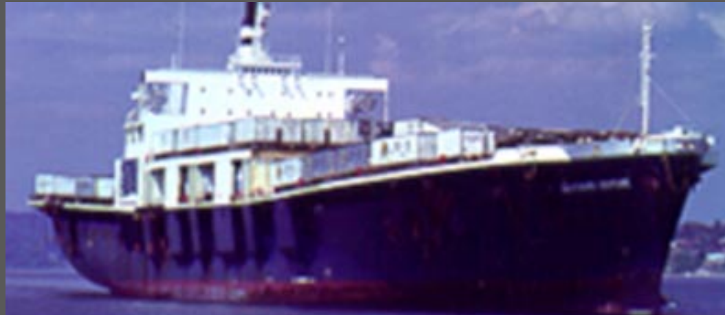
TL and LTL capability on motor-water-motor routes.