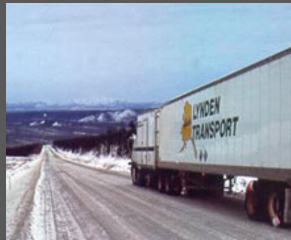
Single carrier responsibility to all Alaska highway locations.

Lynden gives you the added assurance of a single company in complete control right to the destination point. With Lynden having exclusive control from pickup to delivery, anywhere in Alaska, if a claims situation should arise, you have only one carrier to deal with.