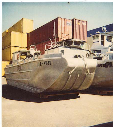
Example of a flat bottom boat. This boat does not require a cradle.