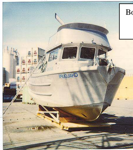
Boat is secure on cradle.