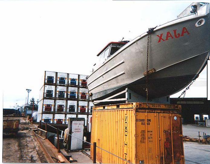
Boat and cradle are secure on platform. Note cradle does not exceed dimensions of the platform.